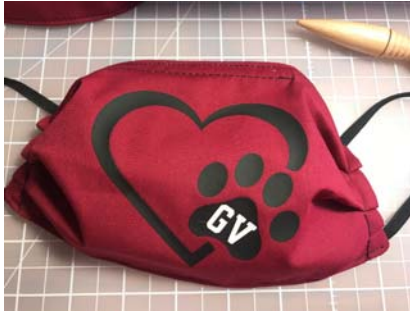
Option4 (Heart with Pawprint GV)