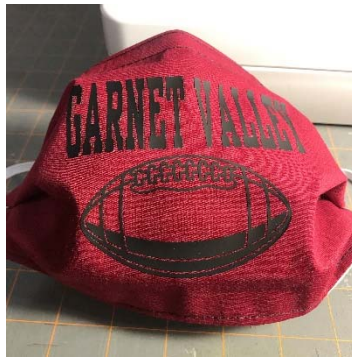
Option 8 (Garnet Valley Football)