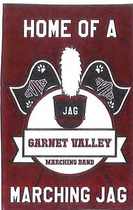
GVHS Marching Band