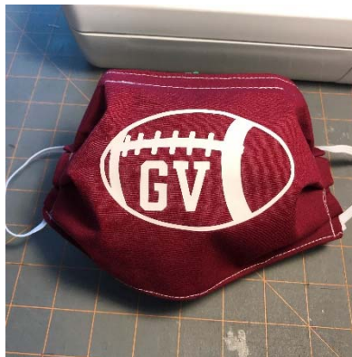
Option 9 (GV Football)