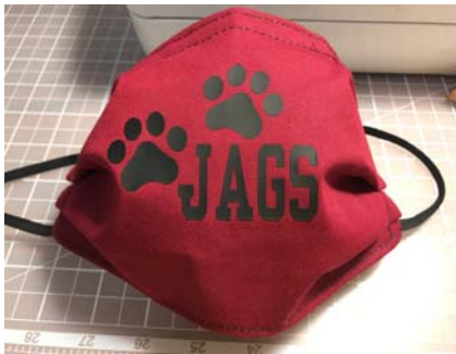
Option 5 (2 Pawprints with JAGS)