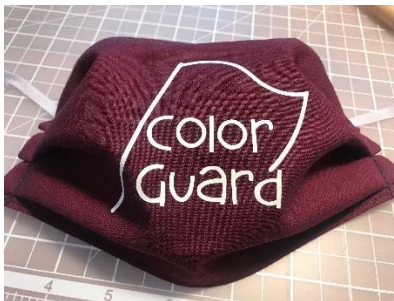
Option 6 (Color Guard)