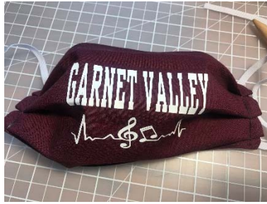
Option 7 (Garnet Valley Music Heartbeat)